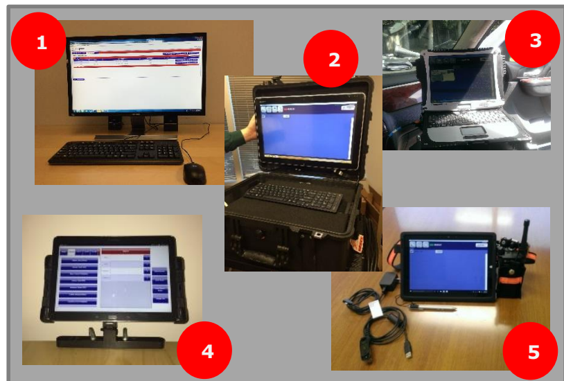
Fireground Accountability Product Examples